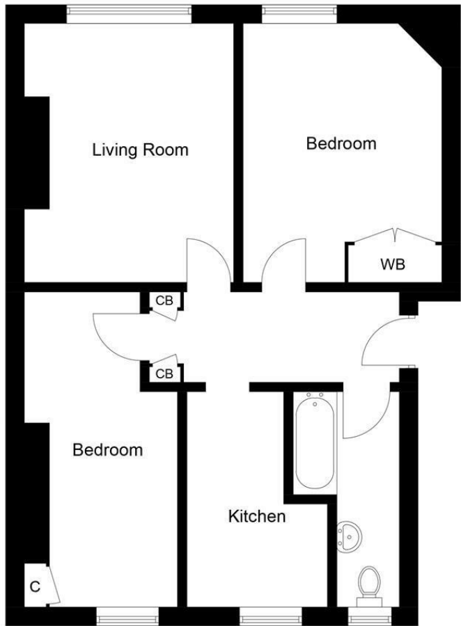
Illustration for identification purposes only, measurements are approximate, not to scale. ( ID 1189739 )